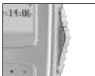
4-position switch for single-handed operation.